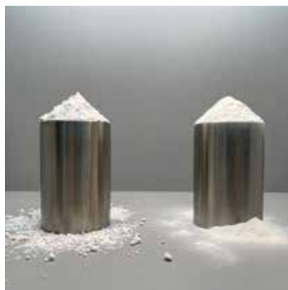
Flowability comparison of different glidants

Regulatory and quality aspects: All CompactCel® FLO formulations can be used for pharmaceutical products and for nutritional or dietary supplements.