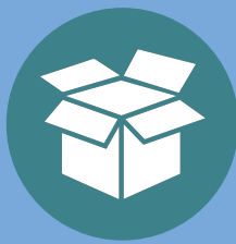
Material on stock