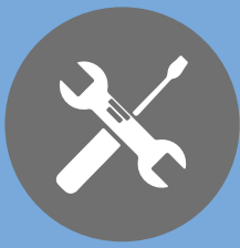
Tech support on site