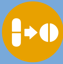
Reformulation capsule to tablet